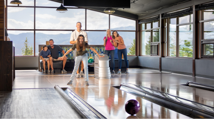
The Shed is a casual and family-friendly activity center that's designed to bring families together.

After completing The Hills short course last summer, Promontory isn't resting on its laurels. Next in the queue is an expansion of its Lavender Spa, the opening of Porto restaurant (its seventh dining venue on property), and the addition of six pickleball courts.