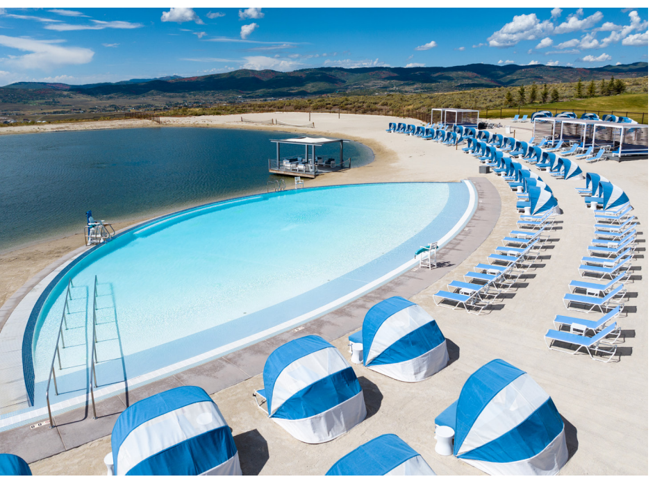
A beach at 7,000 feet! Promontory's private Beach Club is part pool, part lake.

66 Promontory is beautiful. The scenery is unbelievable and the long-range views of Deer Valley and Park City are wonderful." — PETE DYE