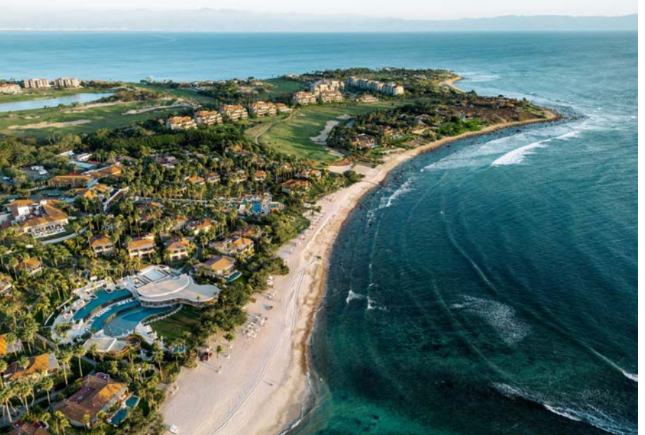
A gracious St. Regis butler welcomed players upon arrival, setting the tone for meticulous, personalized service. Lavish guestrooms are nestled in several buildings, creating a small-village feel. Unexpected niceties include complimentary morning coffee service (served in sterling silver) and pressing of dress shirts and evening wear.