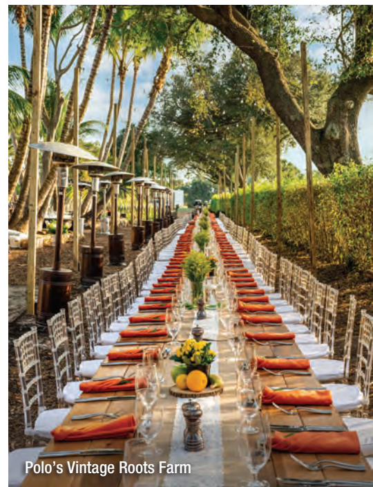
Polo's Vintage Roots Farm