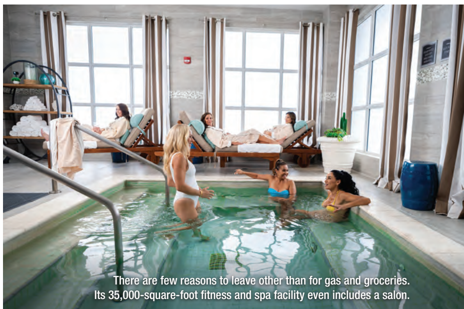
There are few reasons to leave other than for gas and groceries. Its 35,000-square-foot fitness and spa facility even includes a salon.

“Our social calendar is packed with activity,” stated Lili