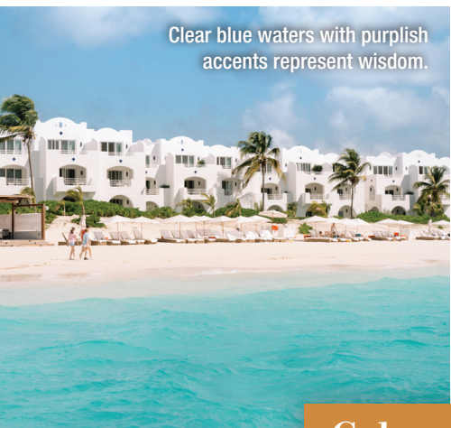
Clear blue waters with purplish accents represent wisdom.

For more information, please visit AuroraAnguilla.com .