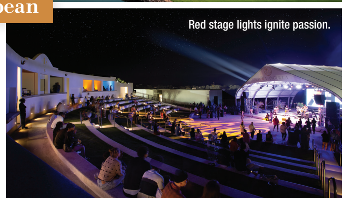
Red stage lights ignite passion.