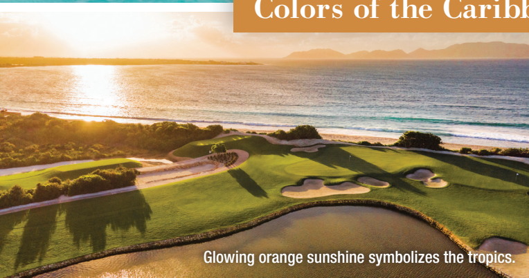
Glowing orange sunshine symbolizes the tropics.