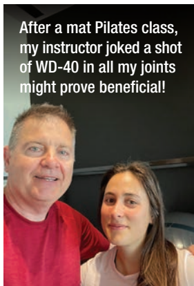
After a mat Pilates class, my instructor joked a shot of WD-40 in all my joints might prove beneficial!