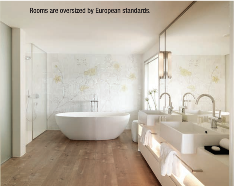
Rooms are oversized by European standards.

ENJOY ONE OF THE MOST LAVISH BREAKFAST BUFFETS , including sobrassada, a raw, cured sausage from the Balearic Islands of Spain made with ground pork, paprika, and spices.