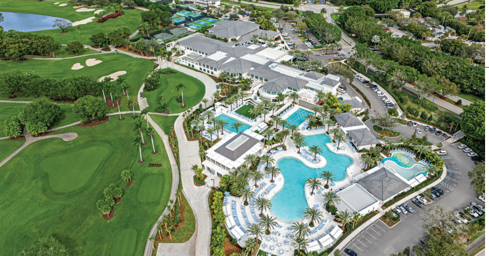
Pictured above: Brand new Aquatics Center. Pictured right, Boca West was the first country club in the nation to install Inrange radar tracking technology. The gamification system provides entertainment out of seven equipped hitting bays. Bottom left, one of Boca West's ten dining venues. Bottom right, Boca West is expanding its pickleball facilities from 14 to 25 courts. It has become the newest "happy hour" gathering spot.