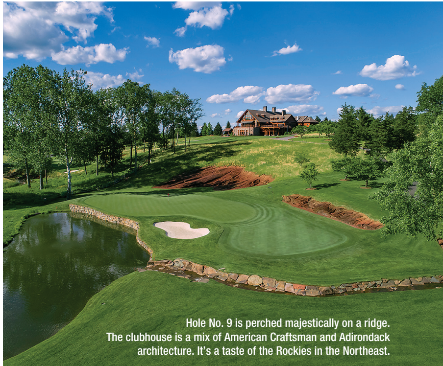
Hole No. 9 is perched majestically on a ridge. The clubhouse is a mix of American Craftsman and Adirondack architecture. It’s a taste of the Rockies in the Northeast.