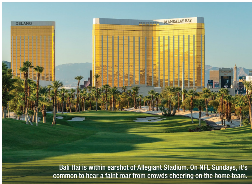
Bali Hai is within earshot of Allegiant Stadium. On NFL Sundays, it’s common to hear a faint roar from crowds cheering on the home team.

The famous phrase “drive for show, putt for dough” implies that tee shots are fun to watch, but putting is where the rubber meets the road. Gary McCord, accomplished professional Tour player, controversial commentator, and respected writer, was quoted, “Billy Walters is who I would select to make a six-footer if money is on the line.”