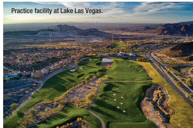
Practice facility at Lake Las Vegas.

DID YOU KNOW? The Environmental Protection Agency (EPA) reports an outboard motor emits nearly 70 times more pollution than a typical family car. ElectraCraft boats are a sustainable, green alternative with an electric propulsion system that is smooth, quiet, and reliable.