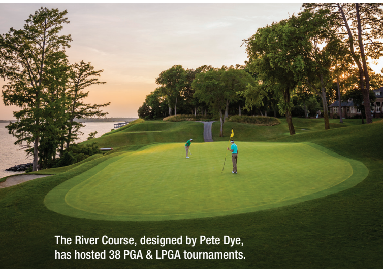
The River Course, designed by Pete Dye, has hosted 38 PGA & LPGA tournaments.

"A passion of mine is leaving the kitchen to speak with our members and resort guests. I recently had a member ask for our famous cornflake breadcrumb crab cake recipe. Jokingly, I told