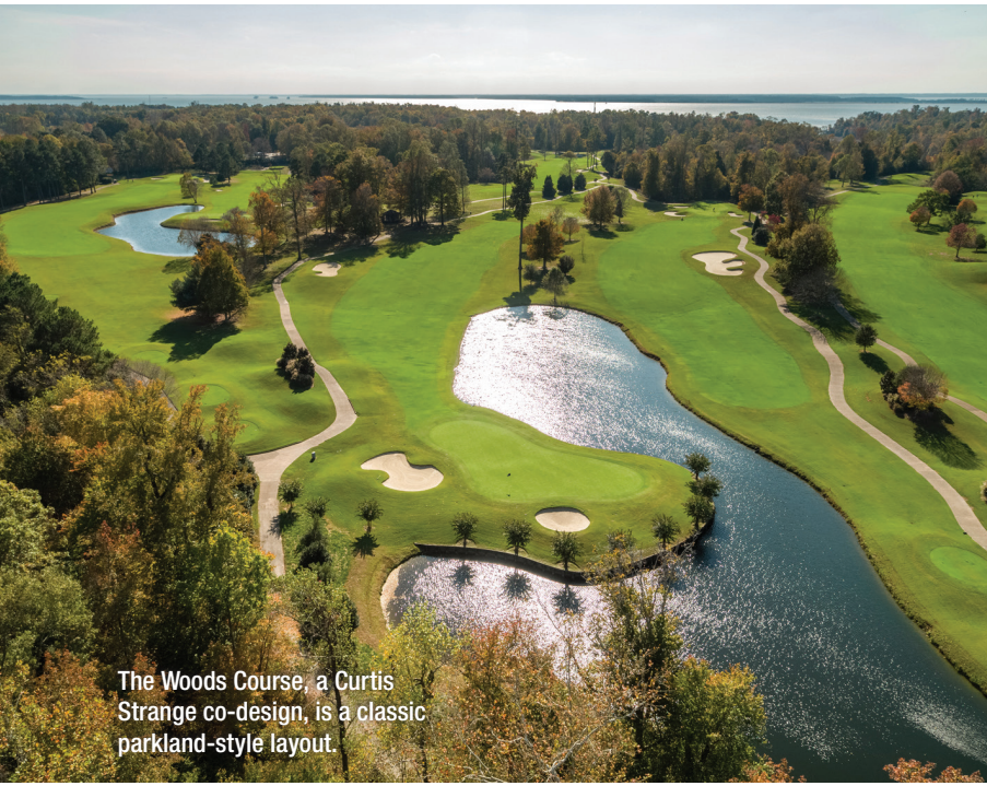
The Woods Course, a Curtis Strange co-design, is a classic parkland-style layout.