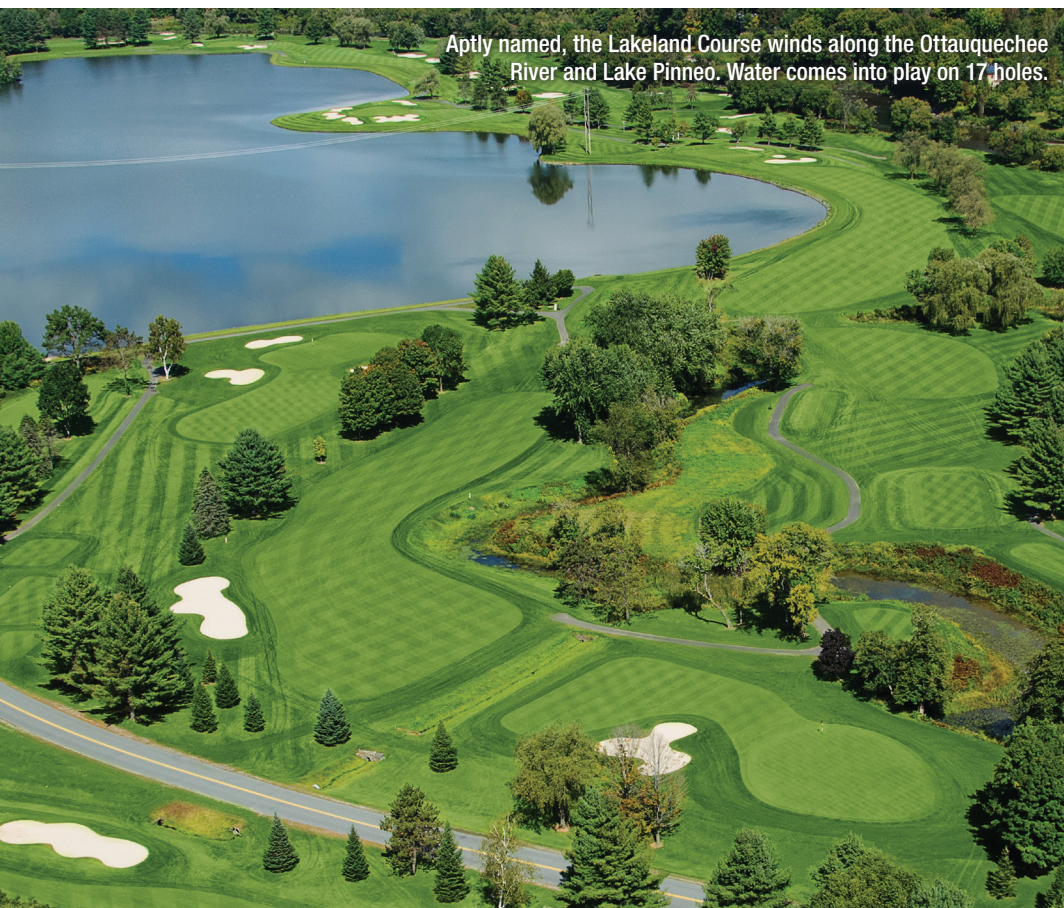
Aptly named, the Lakeland Course winds along the Ottauquechee River and Lake Pinneo. Water comes into play on 17 holes.