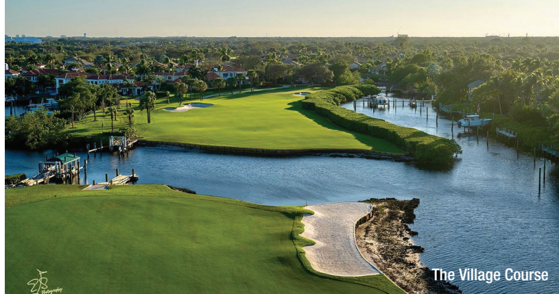
The Village Course