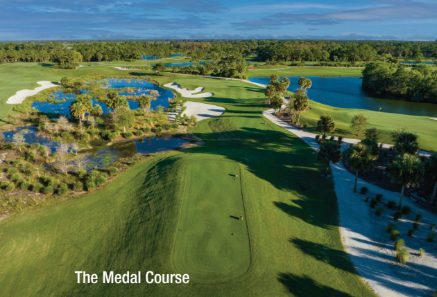
The Medal Course