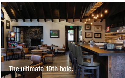
The ultimate 19th hole.