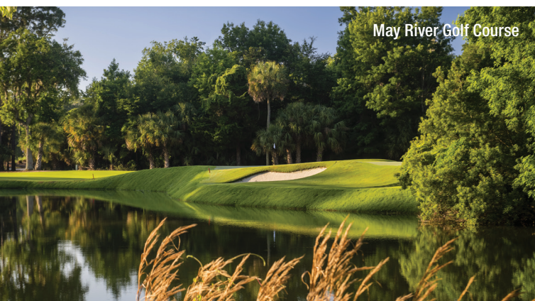
May River Golf Course

After all, Mother Nature is the greatest designer of all time.” — BEN CRENSHAW, GOLF COURSE ARCHITECT